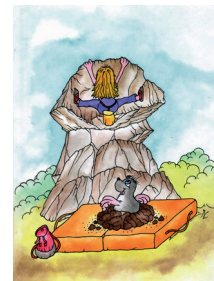
a) Via Marina